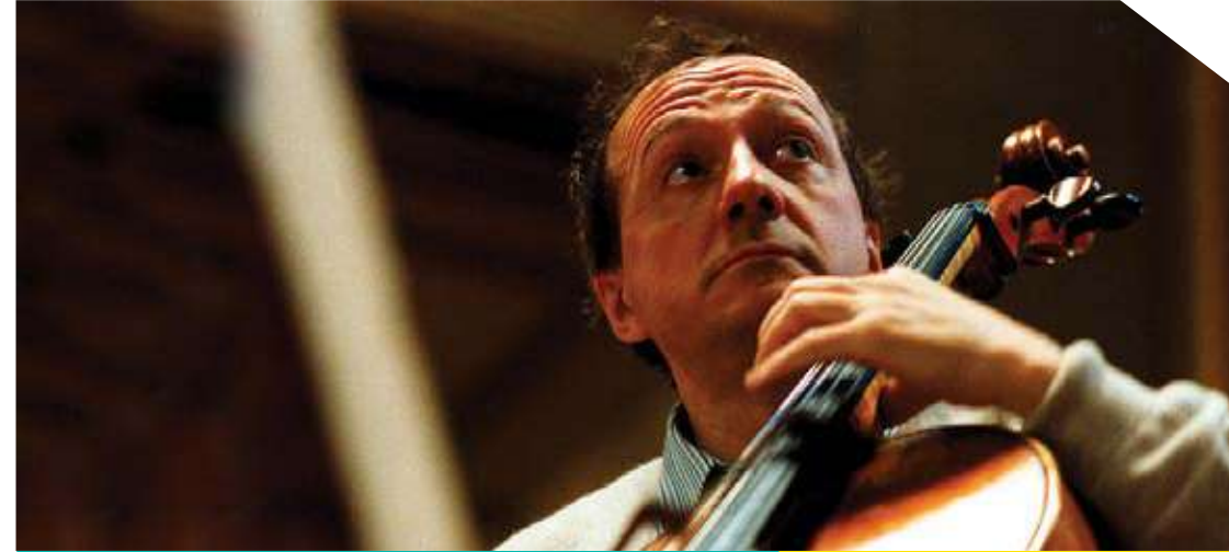
Miklós Perényi / cello

Art Director at Artistico at the International Cello competition "B.Mazzacurati" in Turin, he's been part of important juries in international competitions such as the International Chamber Music Competition in Pinerolo and at the 19th International competition "Paloma O'Shea". In September 2018 he conducted Martha Argerich e Sergey Nakariakov at the Chamber Music Festival in Porto Cervo. He had been Director of Turin Conservatory.