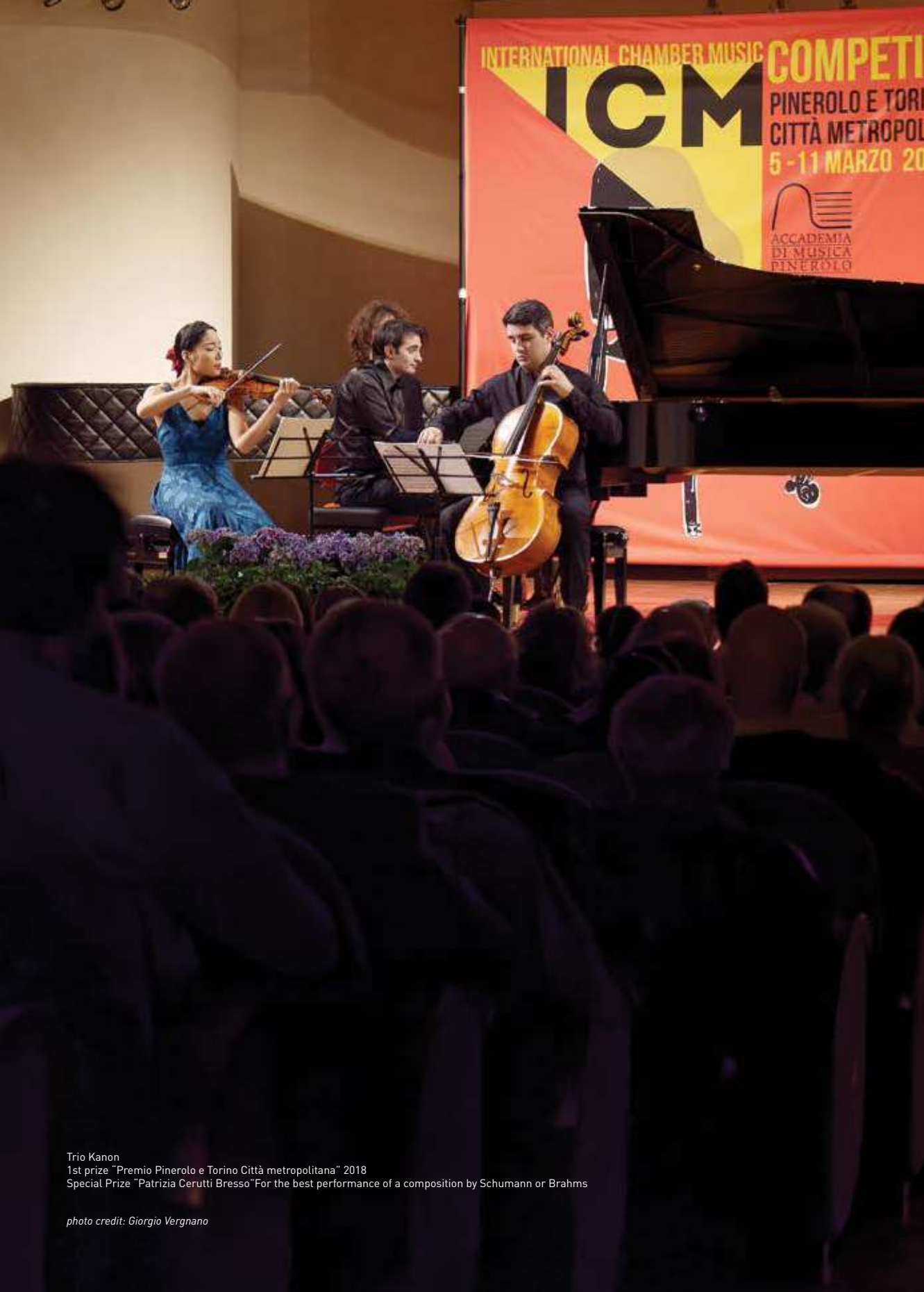
Trio Kanon 1st prize "Premio Pinerolo e Torino Città metropolitana" 2018 Special Prize "Patrizia Cerutti Bresso" For the best performance of a composition by Schumann or Brahms