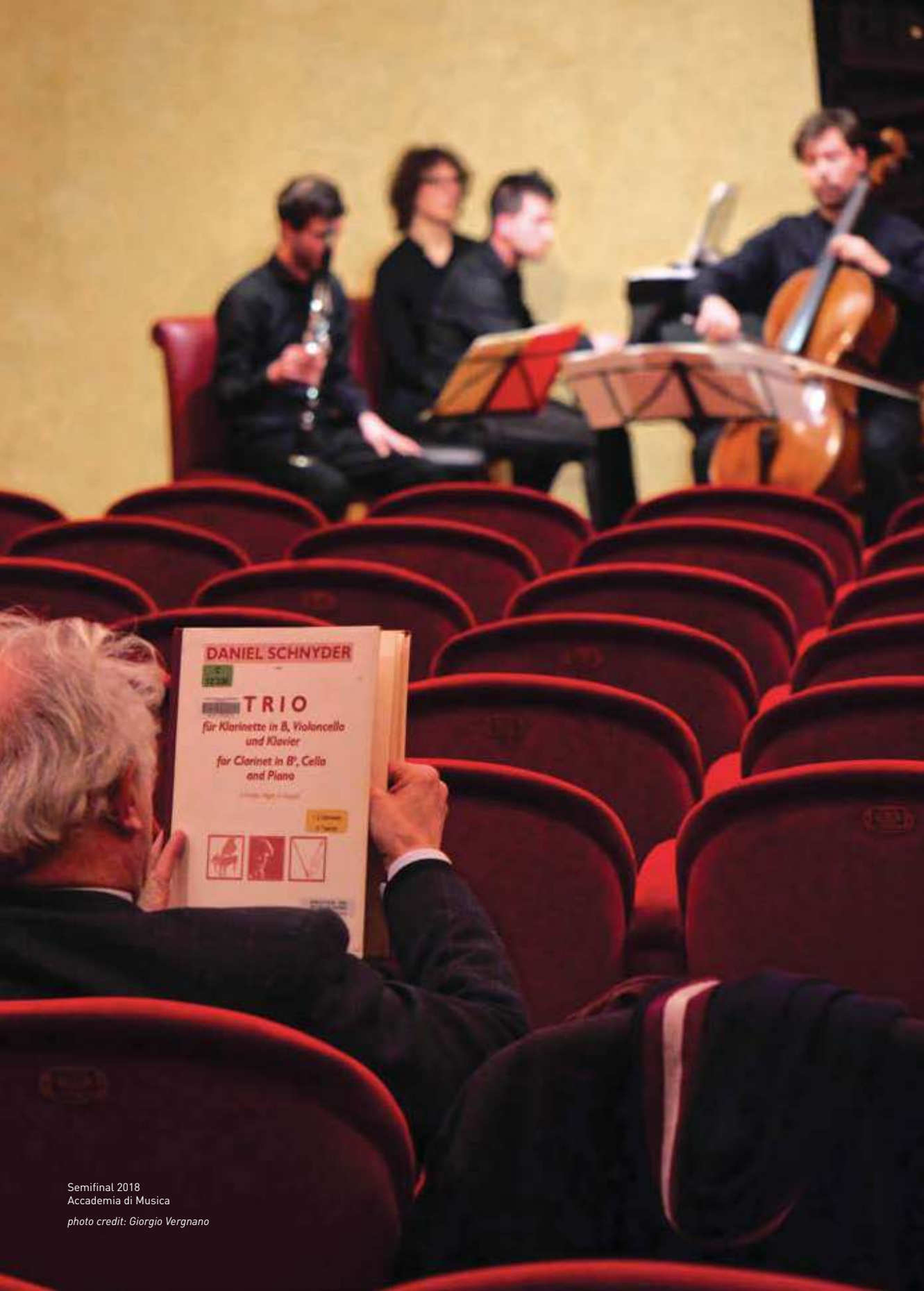
Semifinal 2018 Accademia di Musica