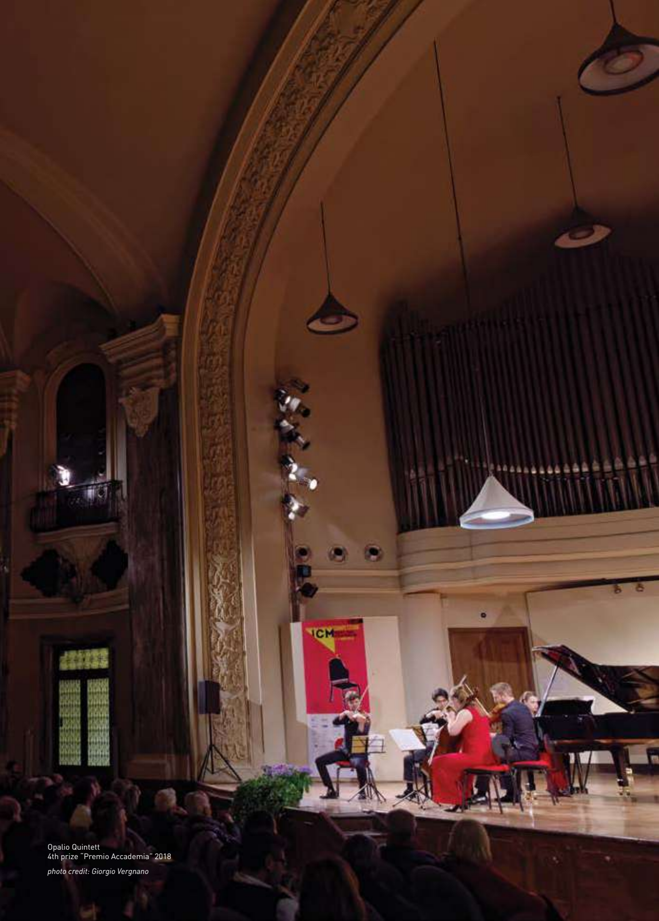
Opalio Quintett 4th prize "Premio Accademia" 2018